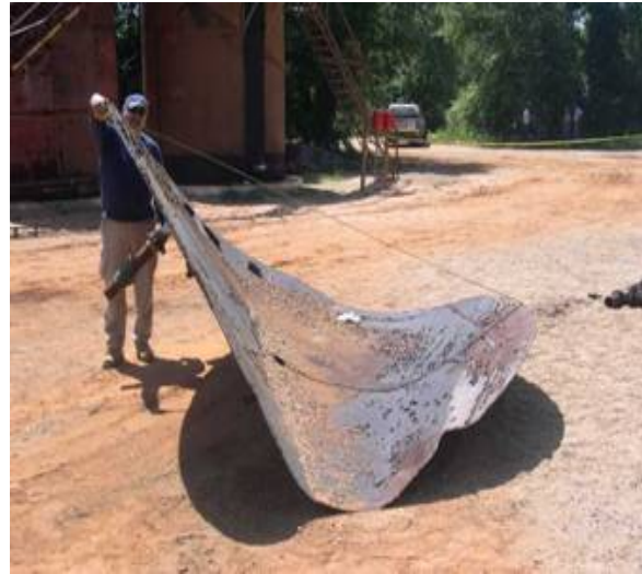
Figure 4. Tank 3 lid