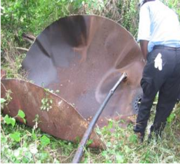
Figure 3. Tank 2 lid