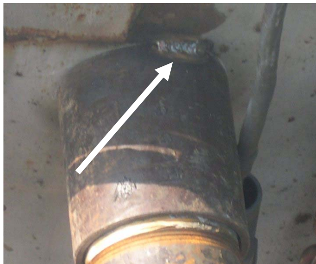
Figure 5. Tack weld and connection being welded to tank 4

explode. Then vapor inside tank 2 ignited followed by the explosion of the tank.